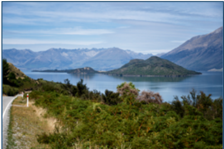
The road to Glenorchy, where Lord of the Rings was filmed