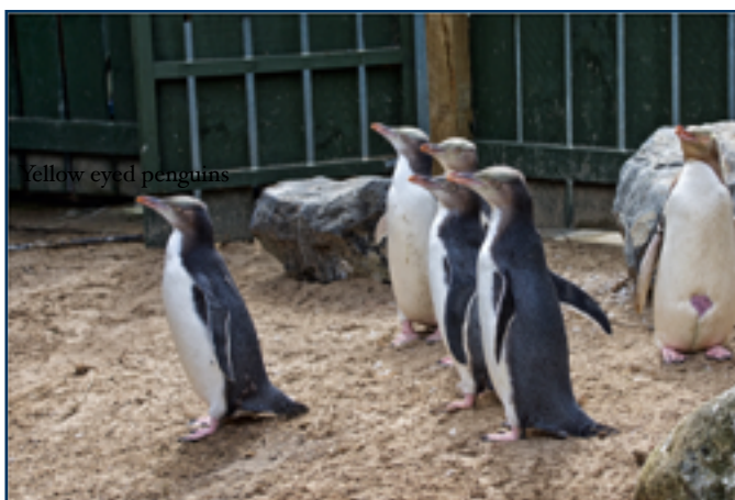
Yellow eyed penguins

Year End Project: Make a triptych image on any subject and the club will print it at the end of the year. There will be a club evening to explain how to do a triptych image